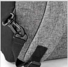
BUILT-IN SAFETY HOOK TO SECURE BAG TO CHAIR OR TABLE IN PUBLIC AREAS