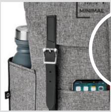
CONCEALED SAFETY POCKET