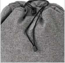
DRAWSTRING SECURELY CLOSSES THE MAIN COMPARTMENT