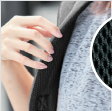
MESH SHOULDER STRAP