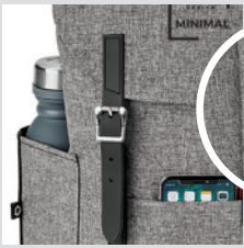
CONCEALED SAFETY POCKET