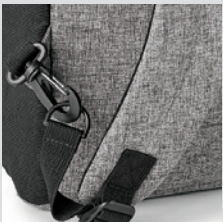
BUILT-IN SAFETY HOOK TO SECURE BAG TO CHAIR OR TABLE IN PUBLIC AREAS