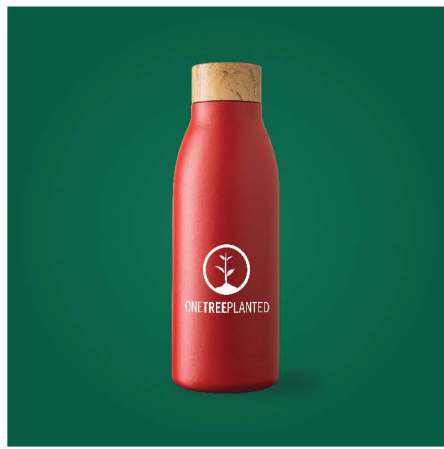
TOP NOTCH NATURAL DW319