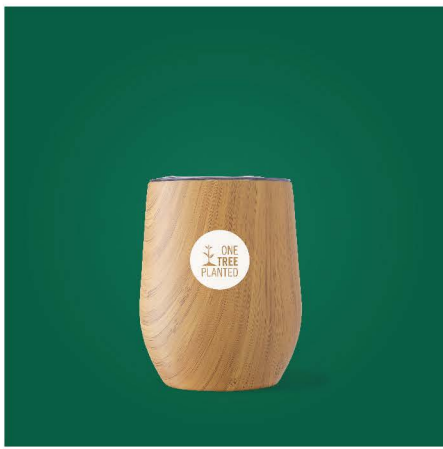
SMALL TALK NATURAL DW404