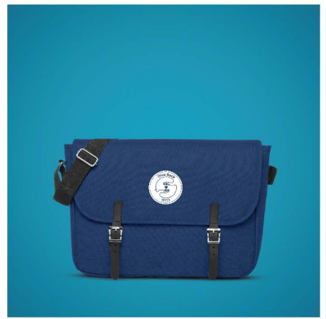
NOMAD MUST HAVES RENEW BGR400