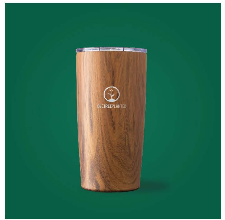
CRUISE CONTROL NATURAL DW410