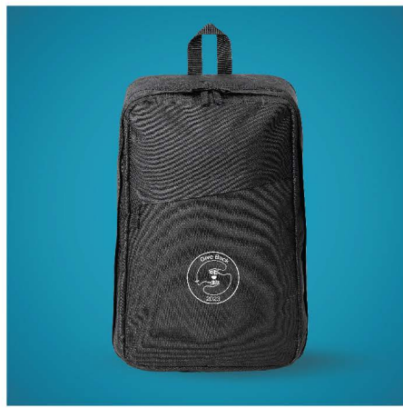
NOMAD MUST HAVES RENEW BGR100